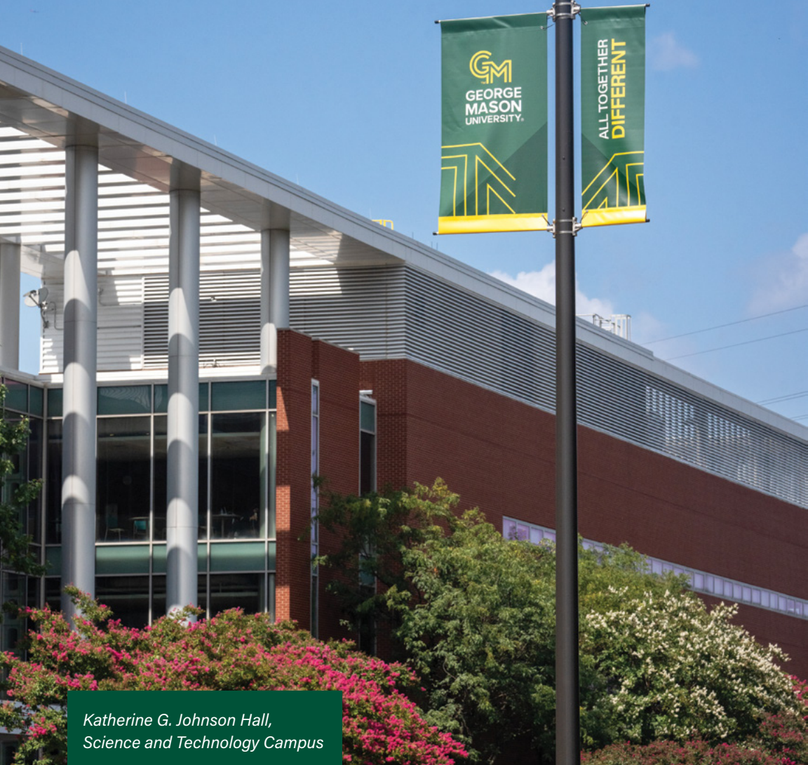
Katherine G. Johnson Hall, Science and Technology Campus