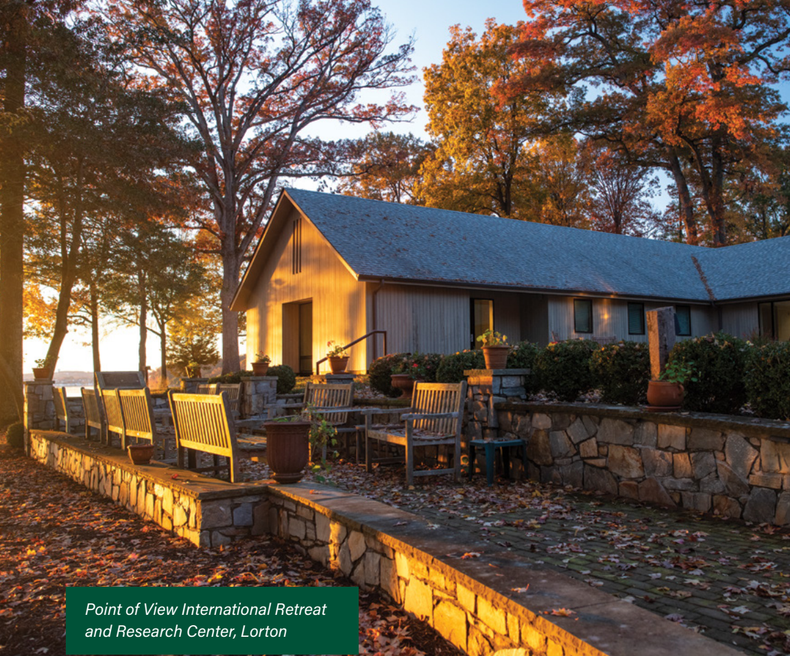
Point of View International Retreat and Research Center, Lorton