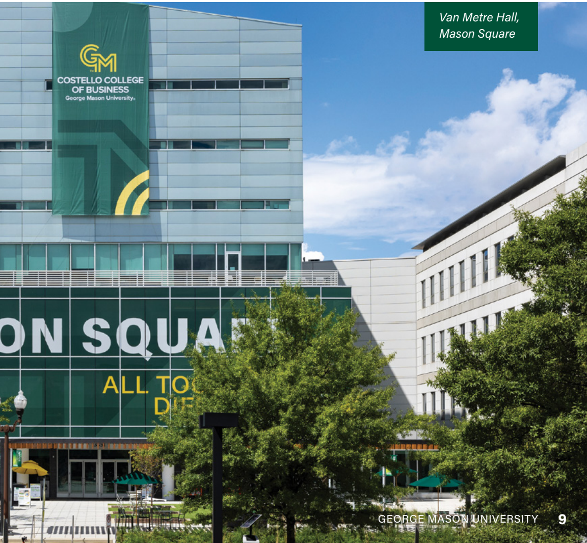
Van Metre Hall, Mason Square

Volunteer Program Assessment is a free volunteer assessment system designed to promote nonprofit organizational effectiveness through the Industrial Organizational Psychology Program at George Mason.