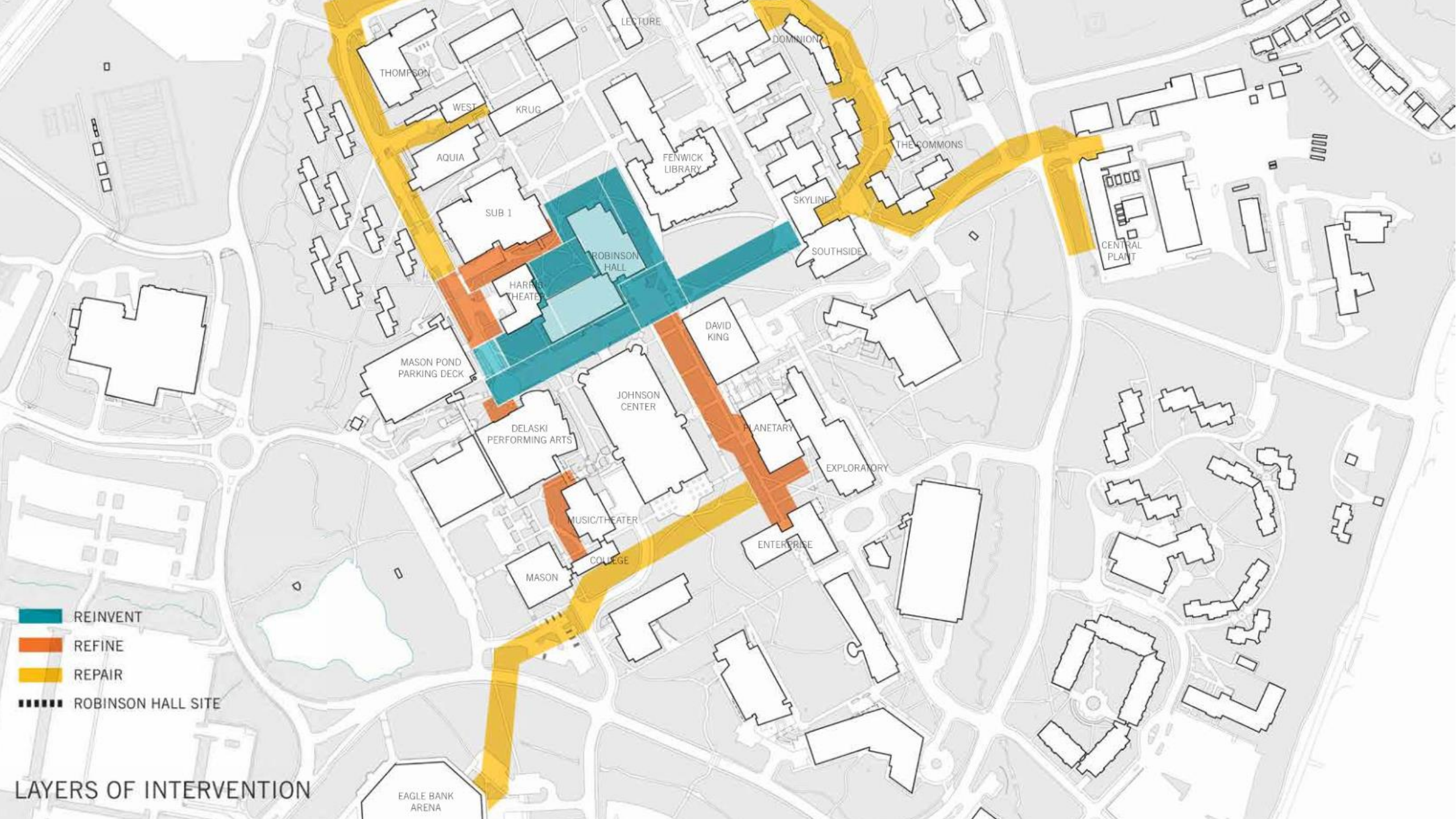
LAYERS OF INTERVENTION