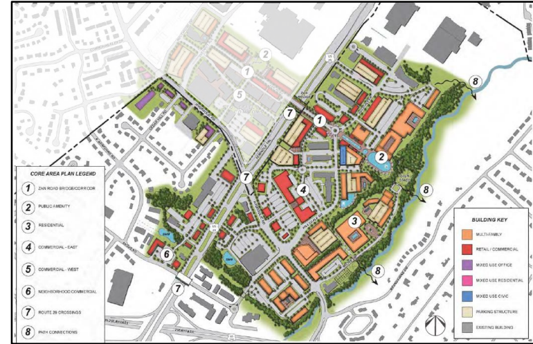
Hydraulic Small Area Plan